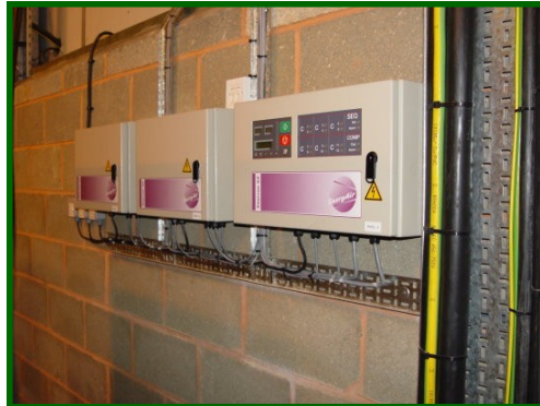
Energair compressor control

Premier Foods achieved a reduction in energy costs, which continues to be validated with on site real time visualization and energy monitoring.