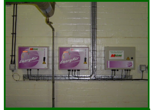
Remote compressor connection location